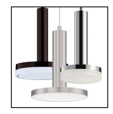
57600 PENDANT ACCESORY (Sold Separately, Fixture NOT included)