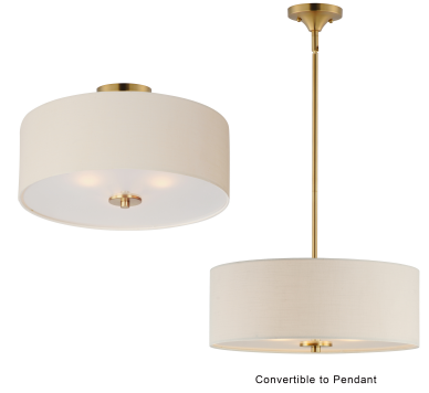
Convertible to Pendant